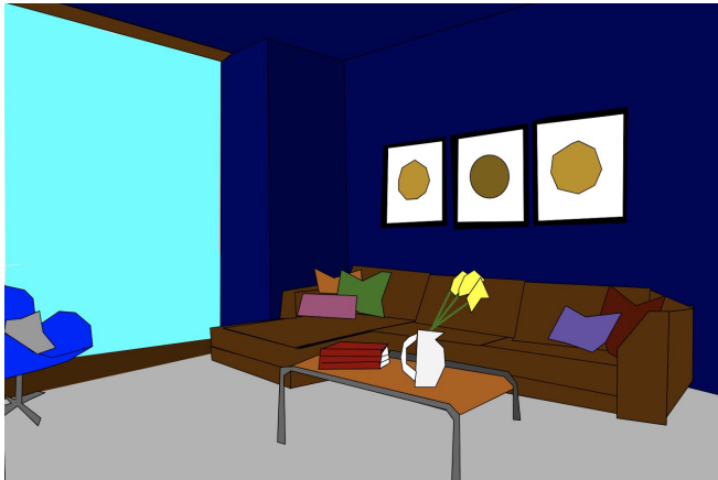
Above: Modern Living Room From Polygons Right: A Phoenix Rising