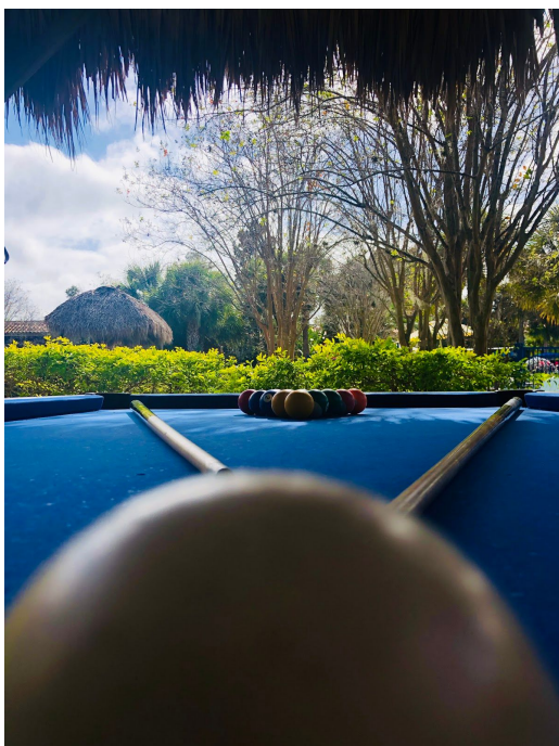
Left: A cue balls point of view Below: Geometry of the tropics

Summer, filled with warmth and magic, inviting you to make memories of a lifetime with friends and family. So, seize the day, and embrace the adventure waiting.